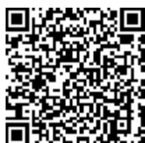
Manual Investment SSF